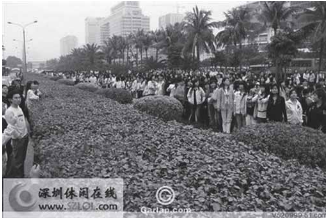
Nearly 1,000 workers from Shenzhen's Hailiang Storage Products firm block a downtown thoroughfare, 19 December 2007

Because there are next to no genuinely representative trade unions in China's private enterprises, workers have no one to turn to when seeking to defend their economic rights and interests. But even if trade union officials were willing to stand up for the workforce against managements, the lack of an effective intra-factory mechanism for resolving disputes means that grievances tend to pile up, causing disputes to escalate. When managements arbitrarily change employees' pay and conditions without consultation, workers are often left with little option but to stage a public protest in the hope of forcing the government to intervene on their behalf. At least nine of the cases in this report were triggered by arbitrary management changes to wage structures and pay rates, workloads and working hours.