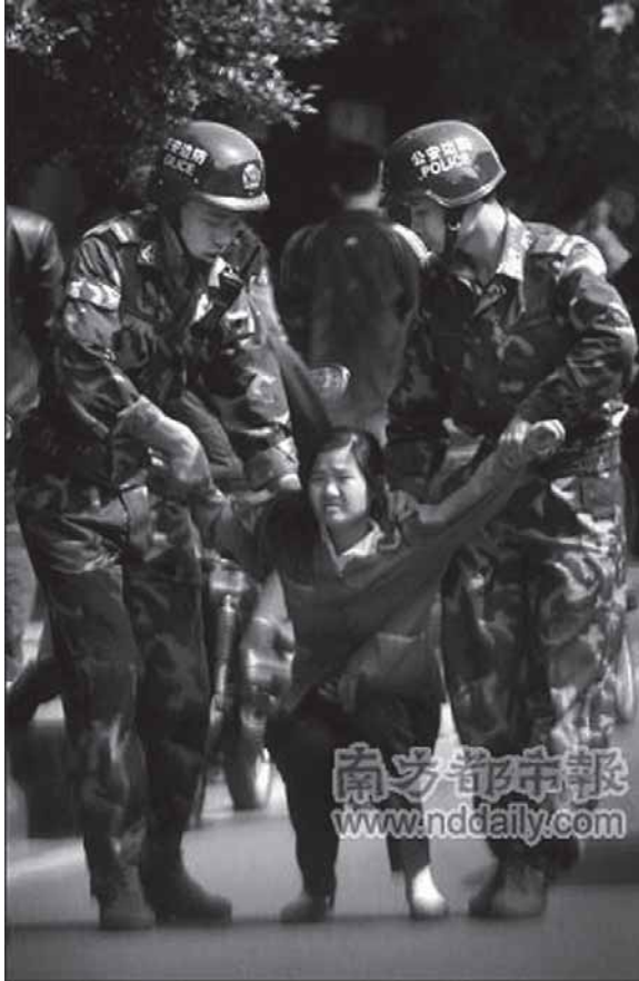
Riot police remove a female worker at a street demonstration during a strike on 6-7 March 2008 by several thousand workers at Casio Electronics, Guangzhou.

Police intervened in at least 61 of the 100 cases reviewed here. On occasion, police action sufficed to temporarily stifle workers' anger and prevent escalation, but it often created more tension and ultimately led to violence. In at least 19 incidents, there were physical clashes between protesters and police, and some workers and police officers were injured. The available information also shows that the authorities remain keen to press for punishment of protest leaders and participants, including penalties for "breach of public order" (治安处罚) and sometimes also criminal sanctions.